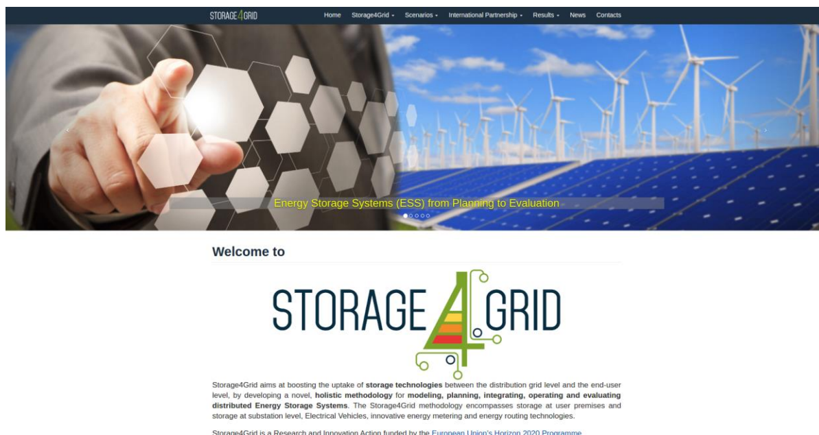
Figure 1 - Home Area

Home area as shown in Figure 1, provides an overview of the aims, vision and results of Storage4Grid project, and lists the essential three scenarios and partners. This area is a starting page from which visitors can get a basic idea of what the Storage4Grid project means and stands for, with the ability to freely navigate to sections that might spark ones' interest.